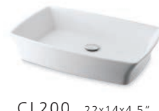
CL200 22x14x4.5" LAVATORY