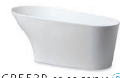
CB553P 66x36x30/24" S