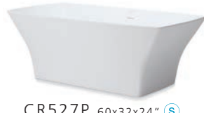
CR527P 60x32x24" S CR553P 66x36x24" S