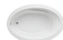
W4266 66x42x20.5" S m a w U