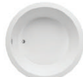
DA500 60x20.5" S a w aw U