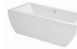
RC553PX 66x36x22" S m a