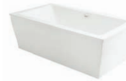
RC553PS 66x36x22" S m a RC/RE630PS 72x36x22" S m a