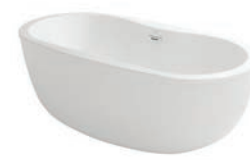
AD553PX 66x36x22" S m a