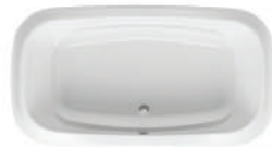
MI635 72x42x23" S m a w ma mw aw MI640 72x48x23" S m a w ma mw aw