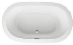
AC553 66x36x22" S m a w ma mw aw U AC630 72x36x22" S m a w ma mw aw U AC635 72x42x22" S m a w ma mw aw U