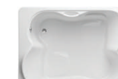
LS640 72x48x25" S m a w ma mw aw