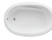
EL530 60x36x20.5" S m a w ma mw aw U EL535 60x42x20.5" S m a w ma mw aw U EL635 72x42x20.5" S m a w ma mw aw U