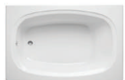
L4872 72x48x20.5" S m W U