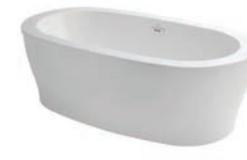
AC553PS 66x36x22" S m a AC635PS 72x42x22" S m a