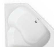
CA550 60x60x20.5" S m W U