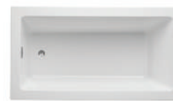
RE525 60x30x20.5" S m a w ma aw U RE525 TL 60x30x20.5" S m a w aw RE527 60x32x20.5" S m a w ma aw U RE527 TL 60x32x20.5" S m a w aw RE553 66x36x22" S m a w ma mw aw U RE630 72x36x22" S m a w ma mw aw U