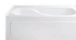
B3260 SL/SR 60x32x20.5" S m a w B3660 SL/SR 60x36x20.5" S m a w B3672 SL/SR 72x36x20.5" S m a w B4260 SL/SR 60x42x20.5" S m a w B4272 SL/SR 72x42x20.5" S m a w