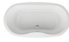
AD553 66x36x22" S m a w ma mw aw U