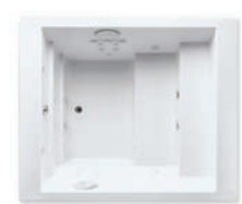
HSR6555 78x66x28" aw U