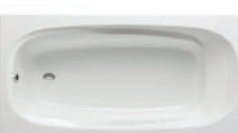
B3060 60x30x20.5" S m a w U B3060TL 60x30x20.5" S m a w B3260TL 60x32x20.5" S m a w B3660 60x36x20.5" S m a w U B3666 66x36x20.5" S m a w U B3672 72x36x20.5" S m a w U B4260 60x42x20.5" S m a w U B4272 72x42x20.5" S m a w U D3260 60x32x20.5" S m a w U