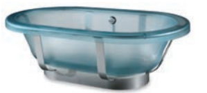
IC635P 72x42x23" S