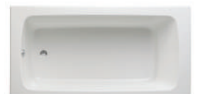
K3060 60x30x20.5" S m a w U K3060TL 60x30x20.5" S m a w K3260 60x32x20.5" S m a w U K3260TL 60x32x20.5" S m a w K3666 66x36x20.5" S m a w U K3666TL 66x36x20.5" S m a w