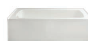
K3060 SL/SR 60x30x20.5" S m a w K3260 SL/SR 60x32x20.5" S m a w K3666 SL/SR 66x36x20.5" S m a w S3060 SL/SR 60x30x18" S m a w S3260 SL/SR 60x32x18" S m a w