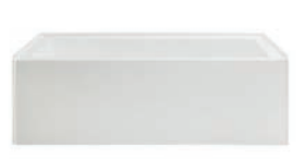
RE525 SL/SR 60x30x20.5" S m a w aw RE527 SL/SR 60x32x20.5" S m a w aw