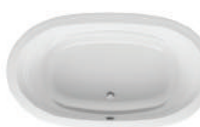
V4266 66x42x20.5" S m a w U V4272 72x42x20.5" S m a w U