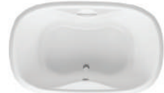
PS5735 68x42x23" S m a w ma mw aw