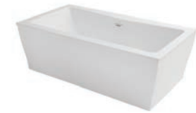
RD553PS 66x36x22" S m a