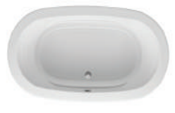
MA553 66x36x20.5" S m a w ma mw aw U MA635 72x42x20.5" S m a w ma mw aw U