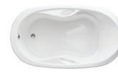
LX553 66x36x25" S m a w ma mw aw LX635 72x42x25" S m a w ma mw aw