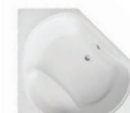
FL550 60x60x20.5" S m a w ma mw aw U