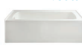
KT525 SL/SR 60x30x20.5" S m a w aw KT527 SL/SR 60x32x20.5" S m a w aw KT553 SL/SR 66x36x20.5" S m a w aw