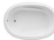
N3660 60x36x20.5" S m a w U N4260 60x42x20.5" S m a w U N4272 72x42x20.5" S m a w U