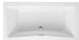
RD553 66x36x22" S m a w ma mw aw U