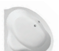
MK550 60x60x20.5" S m a w ma mw aw U