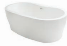
AD553PS 66x36x22" S m a