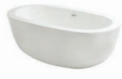
AC553PX 66x36x22" S m a