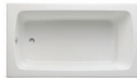
KT525 60x30x20.5" S m a w ma aw U KT527 60x32x20.5" S m a w ma aw U KT553 66x36x20.5" S m a w ma mw aw U