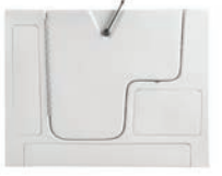
AO3052 SL/SR 52x32x40" S m W mw