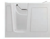
AI3052 SL/SR 52x30x40" S m W mw