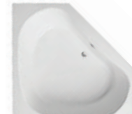
CC550 60x60x20.5" S m a w ma mw aw U