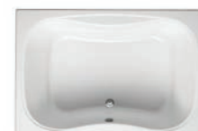
J4260 60x42x20.5" S m a w U J4266 66x42x20.5" S m a w U J4272 72x42x20.5" S m a w U