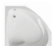
DE4646 55x55x20.5" S m a w ma aw U