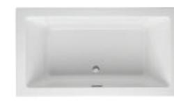
RC553 66x36x22" S m a w ma mw aw U RC630 72x36x22" S m a w ma mw aw U RC635 72x42x22" S m a w ma mw aw U