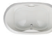
LC635 72x42x25" S m a w ma mw aw