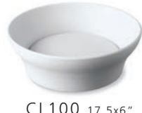
CL100 17.5x6" LAVATORY