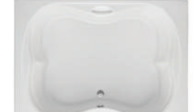
SV640 72x48x20.5" S m a w ma mw aw U