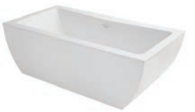
RD553PX 66x36x22" S m a