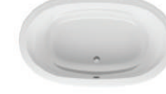
VL5535 66x42x20.5" S m a ma U VL635 72x42x20.5" S m a ma U