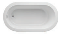
AE553 66x36x22" S m a w ma mw aw U