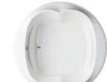
CS600 72x23" S a w aw