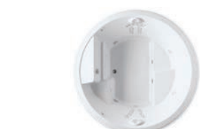
HSC650 78x78x28" aw U