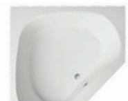
C6060 60x60x20.5" S m a w U