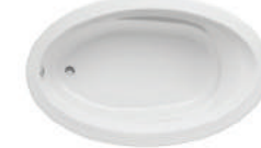
VE5535 66x42x20.5" S m a w ma mw aw U