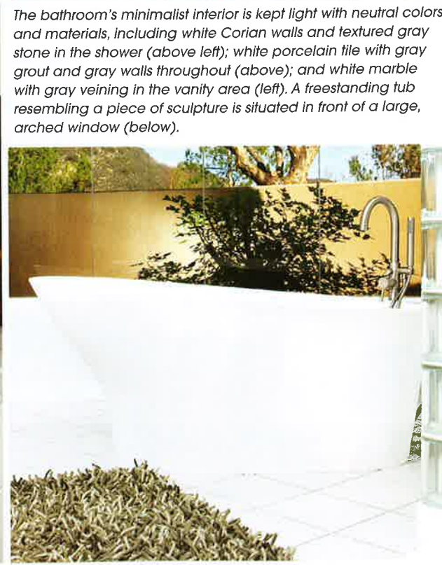
The bathroom's minimalist interior is kept light with neutral colors and materials, including white Corian walls and textured gray stone in the shower (above left); white porcelain tile with gray grout and gray walls throughout (above); and white marble with gray veining in the vanity area (left). A freestanding tub resembling a piece of sculpture is situated in front of a large, arched window (below).