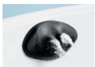
Jetted Neck Pillow