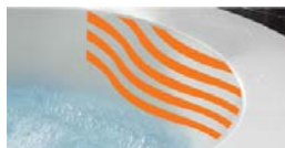
Thermo Comfort Surface Heater