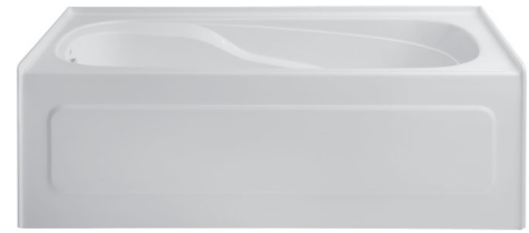
Removable access panel not provided with soaking baths.

Please specify when ordering • Color: CC = Acrylic Color Code: Standard Colors White-WT (01), Bisquite-BQ (40).